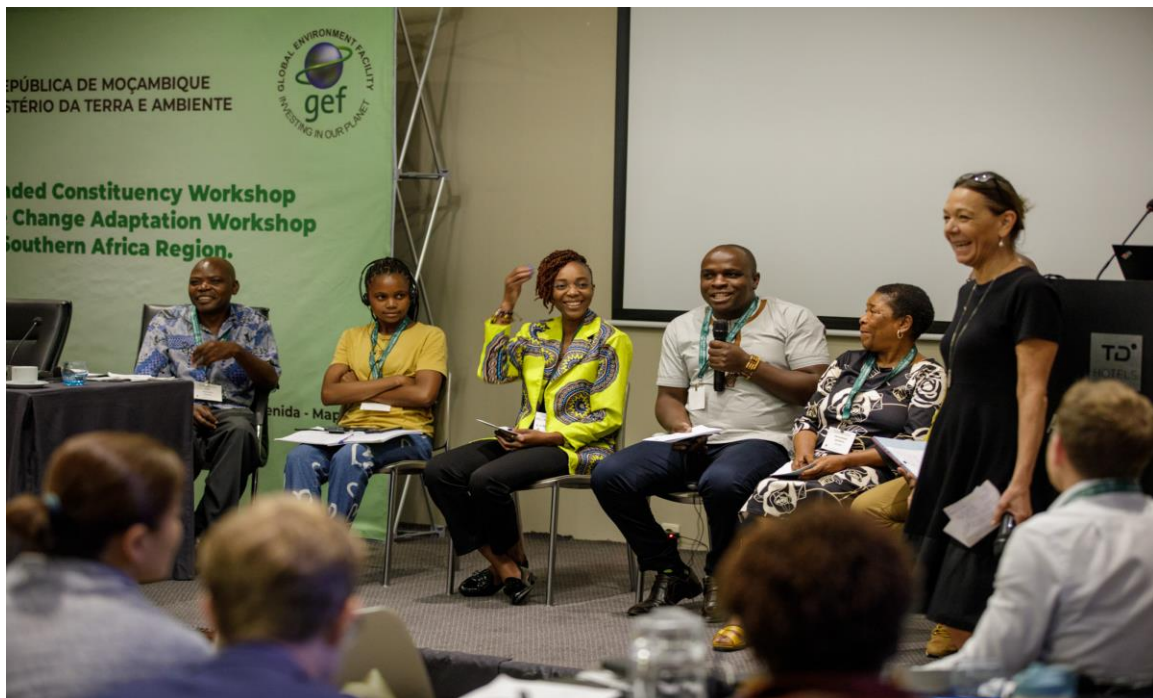
Case study presentation from a cross section of CSO Representatives from the sub-region

The Maputo ECW 2023 was distinct by pulling stakeholders across all levels of the population including the youth, SGP grantee, regional and local CSOs as well as the long serving GCN Chair (global level) and he is a former Southern Africa FRP. The dialogue was meant to exchange knowledge and best practices attained through GEF funding.