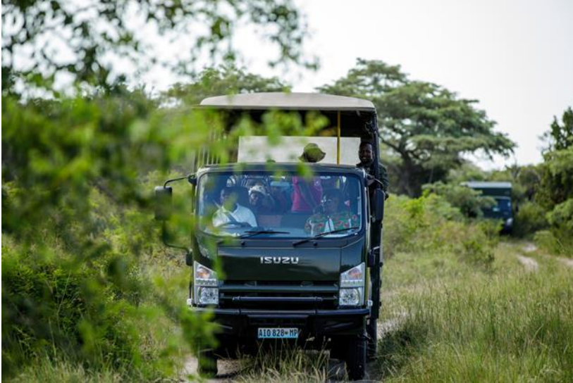
A field trip excursion in the Maputo National Park

Participants also attended the learning trip to one of the biodiversity conservation park in Maputo. The park staff gave detailed lesson on shared benefits on conserving biodiversity which translates to economic growth, poverty reduction, balancing of the natural ecosystems, entrepreneurship capacity development amongst many others.