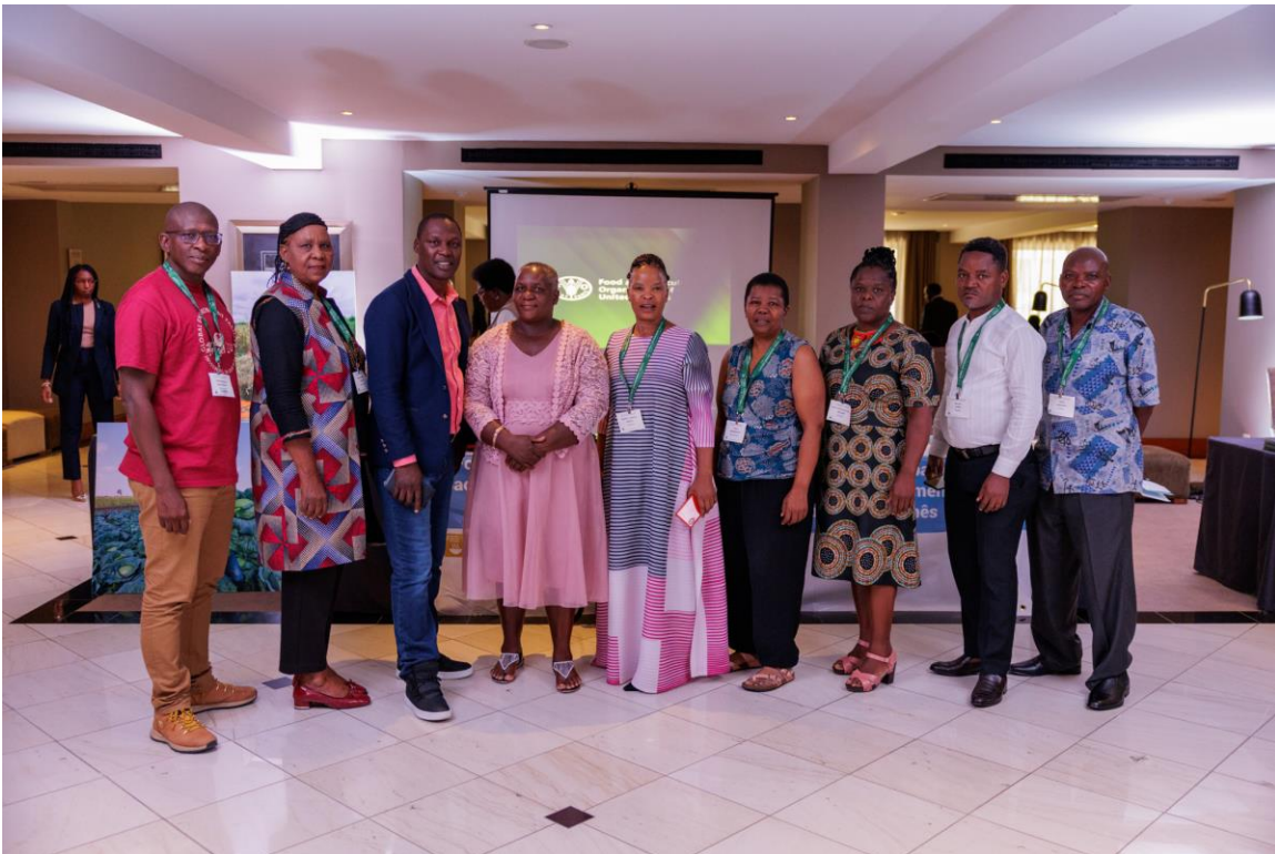
Country Contact Points from the representative countries in Southern Africa

The ECW was attended by Country Contact Points (CCPs) representatives of Civil Society Organisations (CSOs) from the above named countries.